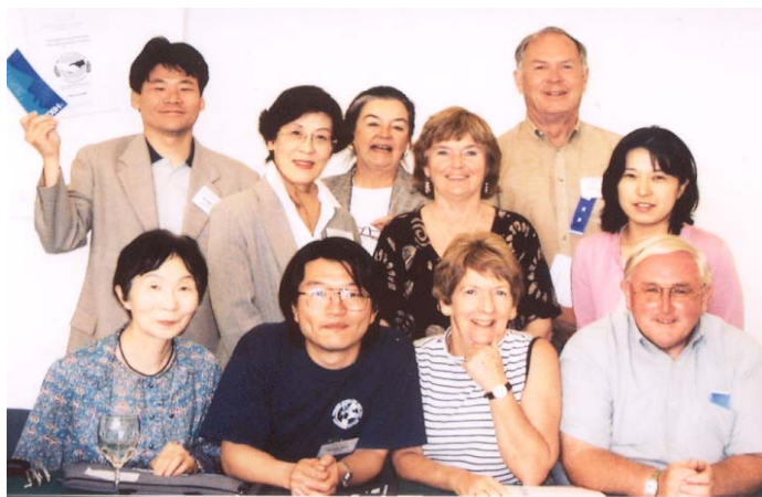
Members of Zenkaren and WFSAD working together during the WFSAD Fourth Biennial Conference in Jerusalem in May, 2000.

We are looking forward to an exciting experience at the Fifth Biennial Conference of WFSAD being hosted by Zenkaren, October 9—12 in Kyoto, Japan. The major concentration of delegates (some 2,000 or more family members) will attend sessions on the 11/12th. International delegates will take part in the whole meeting, beginning with WFSAD's day on the 9th, to welcome and exchange views with members and conduct its more official business at the general meeting. On 12th October international visitors will have a half-day tour of some of the wonders of Kyoto plus visits to mental health facilities. There is a wealth of interesting topics and